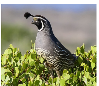
California Quail

Board Meetings are held on the first Tuesday of the Month at 7:00 PM at the United Way meeting room. All members are urged to attend to contribute information and new ideas.