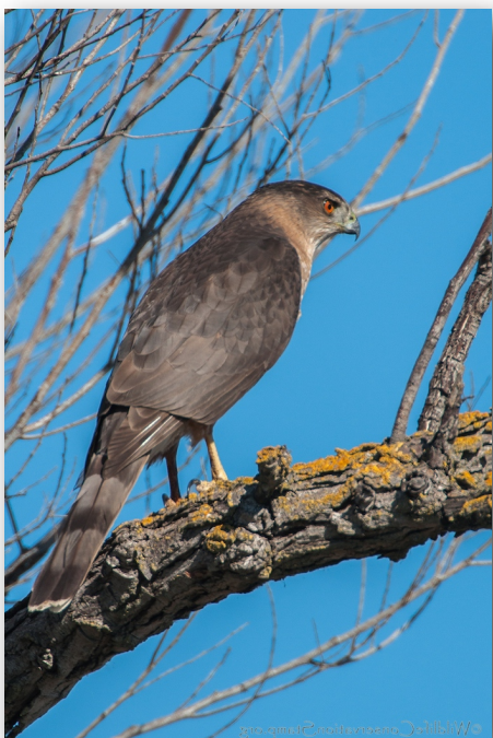
Cooper's Hawk

Sacramento National Wildlife Refuge, Jan 27 Sixteen fun-loving birders participated in the Wintu Audubon outing to Sacramento National Wildlife Refuge, observing a total of 65 species. Even though the impoundments on the refuge did not offer the huge numbers of waterfowl that have been present in past years, there were thousands