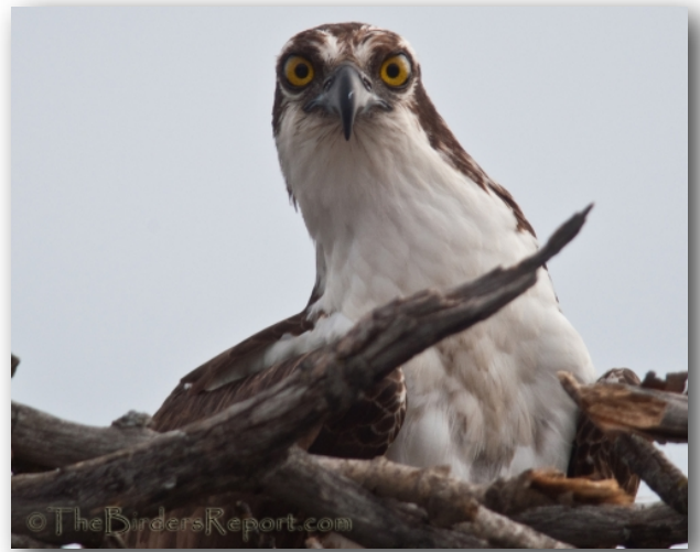
Osprey