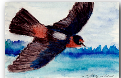
Illustrations – Sally NeSmith

www.wintuadubon.org/reddings-miracle-of-the-swallows/