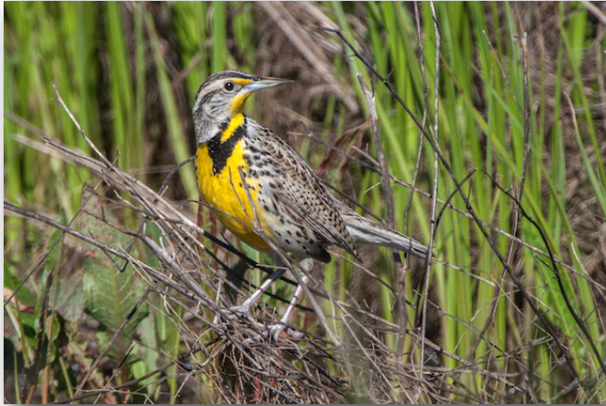
Western Meadowlark