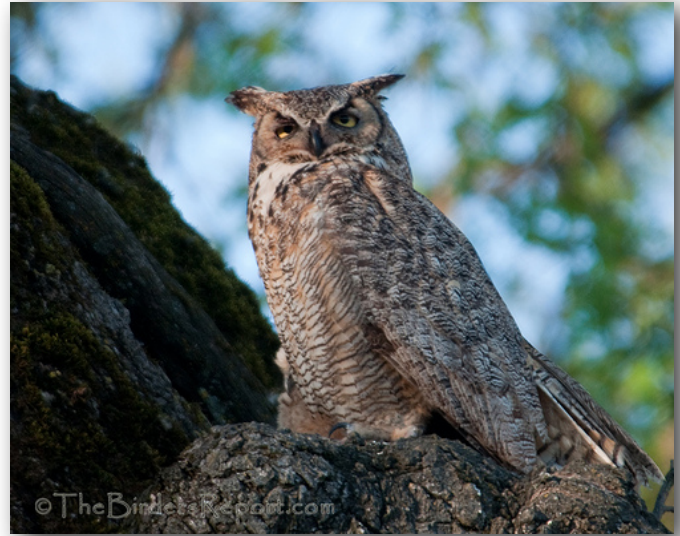
Great Horned Owl

the entrance the entrance kiosk. At the viewing platform, the cottonwoods were alive with early arriving Tree Swallows and even a couple of Barn Swallows. Sharp eyes spotted a pair of Redheads and two pairs of Blue-winged Teals. Meadowlarks and Ring-neck Pheasants were a treat to observe, and two Great-horned Owls were tucked away in willow trees.