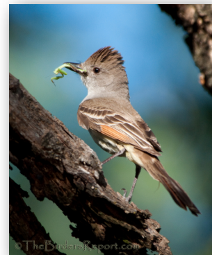
Ash-throated Flycatcher

Threatening rain and a few sprinkles did not keep the birds away. Three local woodpeckers (Acorn, Downy, Nuttall's), Cooper's Hawk, Black-headed Grosbeak, Western Tanager, Ash-throated and