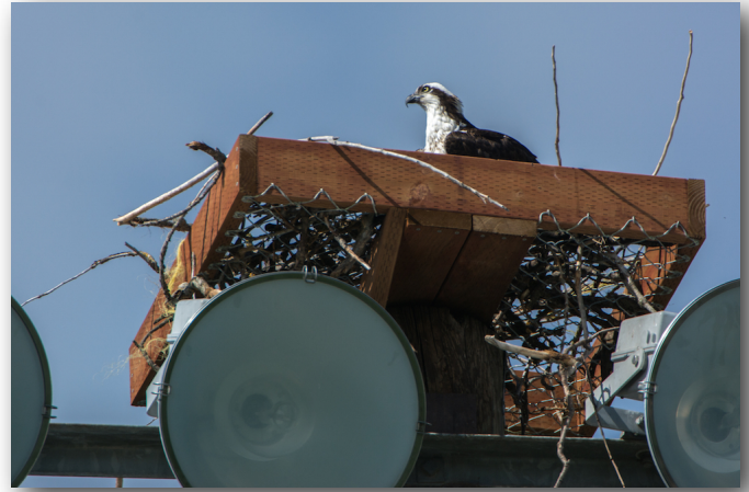
Osprey on New Nesting Platform

Keep current of upcoming events & birding information. Visit our website wintuadubon.org