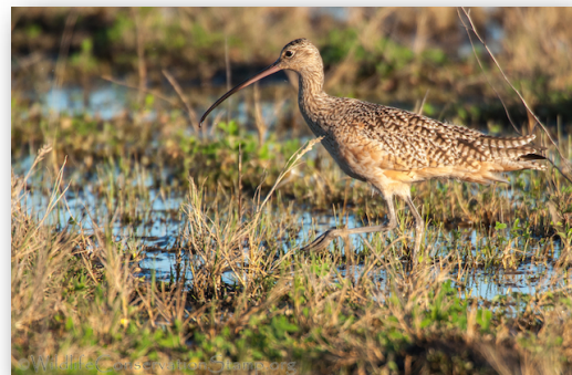
Long-billed Curlew