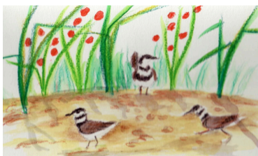
Killdeer