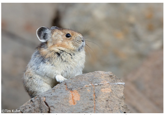
Pika