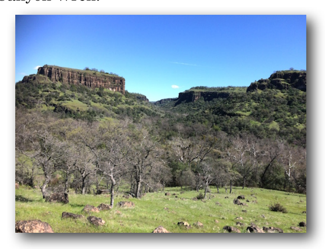
Dye Creek

Gray Davis Dye Creek Preserve offers only limited public access, so it was unfortunate that only four brave birders made the trek up the canyon on what turned out to be a gorgeous, clear and warm day. The birding actually began at Cone Grove Park, on the way to the preserve, where we tallied 26 species, including Wood Duck, Cliff Swallow, and the California endemic Yellow-billed Magpie. Traveling south on Foothill Road to the preserve entrance we added several species to the list including Cinnamon Teal, American Wigeon, many Wilson's Snipe, a telemetry-collared Ross's Goose and several Tricolored Blackbirds. Dye Creek Preserve itself showed us 41 species for a total of 62 for the trip. The best sightings at Dye Creek were a Vesper Sparrow, Peregrine Falcon and Golden Eagle, topped off with a singing Canyon Wren!