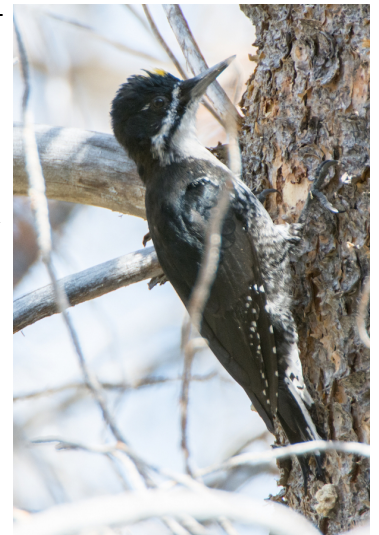
Black-backed Woodpecker

July 28–29 Due to the late snows last winter, the Lassen Park Annual Outing took place at the end of July, a bit later in the season than it had been in the past. Several members of Wintu and Altacal Audubon Societies began the weekend camping out at Lost Creek campground Friday