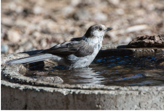
Gray Jay

year however, the spectacle of Nighthawks was interrupted by a pair of Vaux's Swifts showing off their aerial acrobatics!