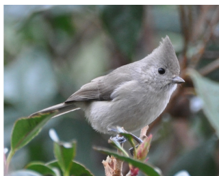
Oak Titmouse

Board Meetings are held on the first Tuesday of the Month at 7:00 PM at the United Way meeting room. All members are urged to attend to contribute information and new ideas.