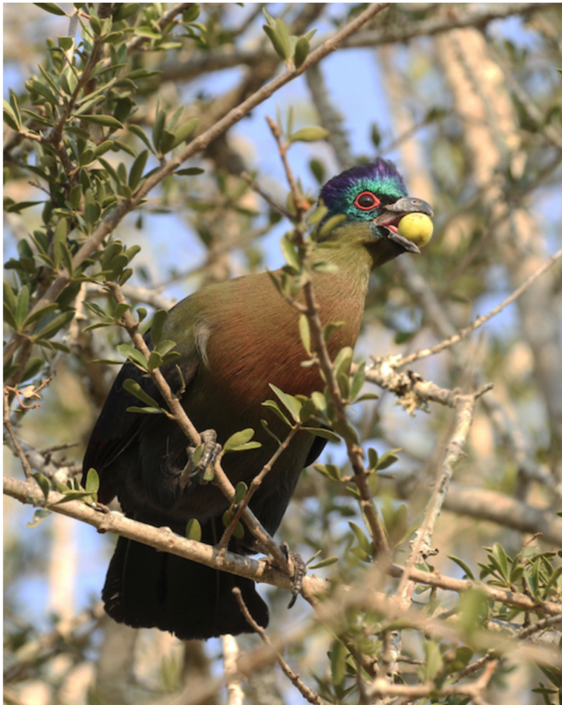
Southern Africa's Birds and Wildlife

North State Giving Tuesday is an online networking and giving event that provides nonprofit organizations the opportunity to gain exposure and start relationships with new donors, and for the people in Shasta, Siskiyou, and Tehama counties to come together to raise as much money as possible for participating organizations within a 14 -hour period. The effort is organized and implemented by the Community Foundation of the North State with presenting sponsorship provided by Merchants Bank of Commerce. The online event takes place this Tuesday, December 1st from 6:00 AM to 8:00 PM . Wintu Audubon Society participates in this nonprofit event and appreciates any and all contributions which allow us to fund projects like Burrowing Owl conservation, youth outreach, a songbird nestbox program, and hopefully in the not to distant future, a Northern Saw-whet Owl banding station! And, of course, environmental advocacy. https://www.northstategives.org/wintuadubon